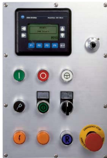
Control panel SFV 1200