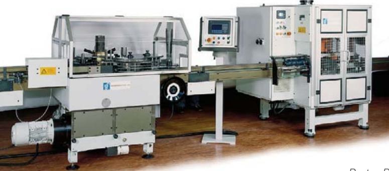
Parter PAV 1200 with Spin Flanger SFV 1200