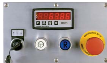
Digital height indication