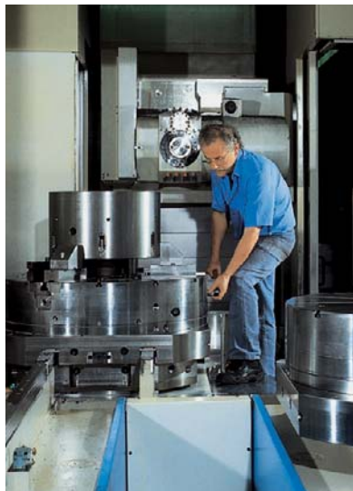
PLC controlled production units for high precision tool manufacturing.