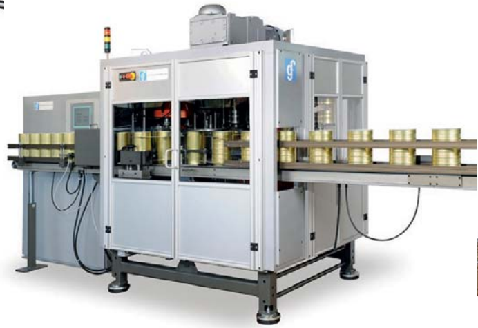
Combined Spin Flanger/Beader SBV 400.

High flexibility and space saving setup thanks to electronic synchronisation.